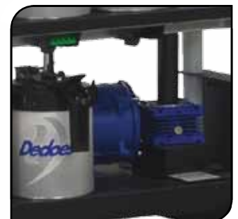
Gear-reduced drive system is quiet and durable

Dedoes U.S. - Headquarters 1060 W. West Maple Rd. Walled Lake, MI 48390 For technical support on our products or additional accessories, Please call us at 248-624-7710 or visit our web site: www.dedoes.com