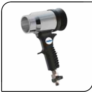
Individual Odyssey Amplifier

Air movement accelerates dry time the most