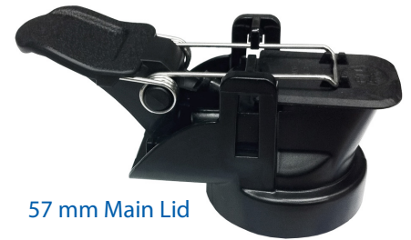
57 mm Main Lid

The Variable Flow Spout is designed for use on auxiliary containers for clears and reducers. The main lid is versatile while utilizing various adapters to accommodate different types of containers and threats.