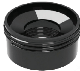
VA001 32mm Rieke Adapter