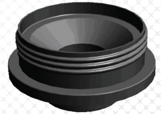
VA004 42mm Rieke Pull Up Adapter